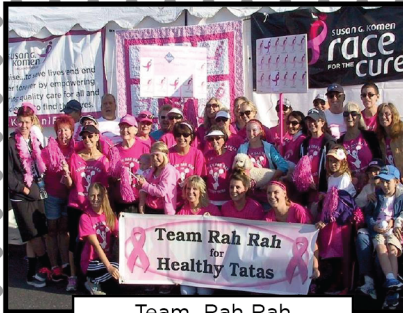
Team Rah Rah for Healthy Tatas