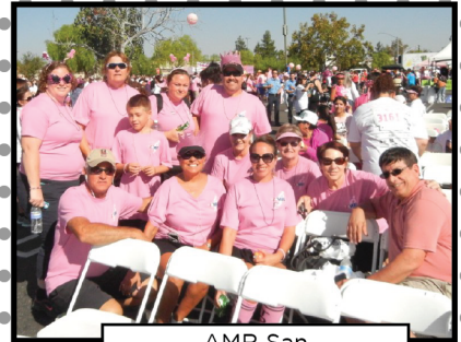
AMR San Bernardino Team

17 th Annual Susan G. Komen Inland Empire RACE FOR THE CURE®